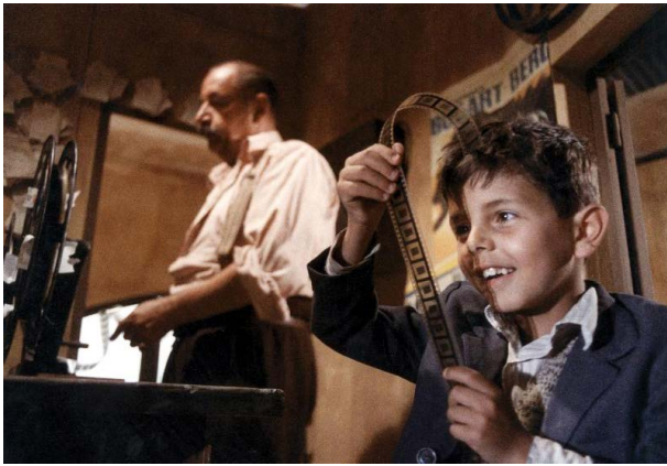
Cinema Paradiso screens Thursday, March 8.

its alliance with the United States. The series continues Thursday, March 8 , at 3:30 and 7 p.m. with Cinema Paradiso in the Ellis White Lecture Hall in the Hammond Campus Center.