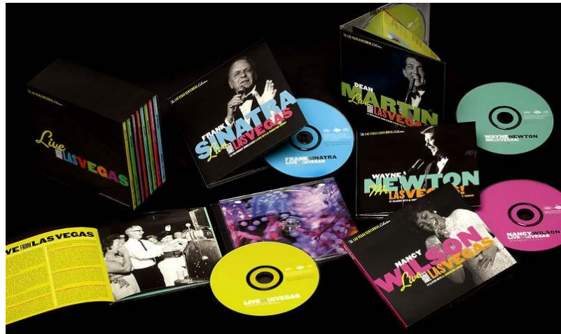
This series of CDs was also created by Stoltze Design.