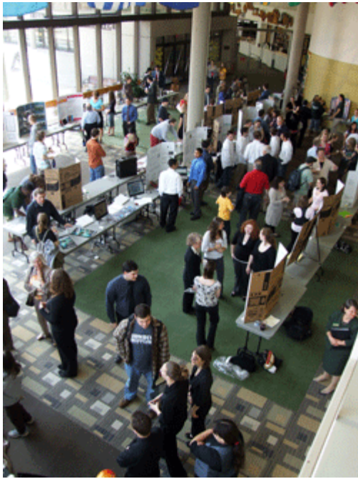
The Undergraduate Conference on Research continues to grow.