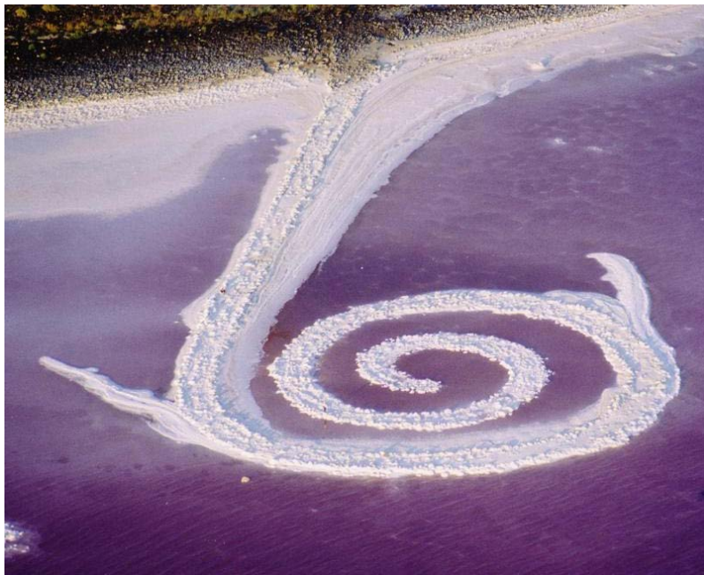
"Spiral Jetty" Robert Smithson.