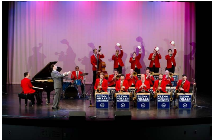
The Glenn Miller Orchestra performs Saturday, Dec. 13.

Tickets for "In the Christmas Mood" are $28 for adults; $25 for seniors and Fitchburg State alumni; and $5 for students. The Weston Box Office, located inside Weston Auditorium, is open Thursday and Friday from 12:30 to 3:30 p.m. and can be reached at 978-665-3347. Tickets may also be purchased online .