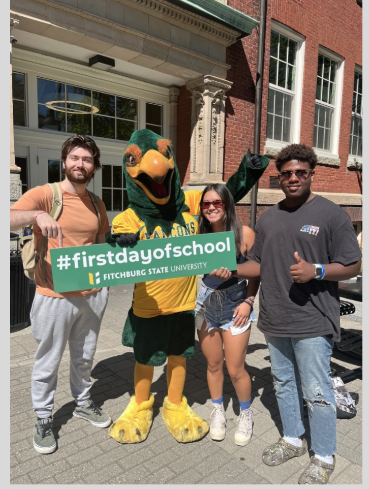
on Facebook, Twitter and LinkedIn.