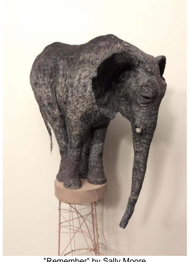
"Remember" by Sally Moore