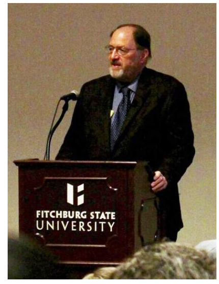
Economist James Galbraith's presentation on economic inequality drew a huge crowd on Tuesday night.

Photos from the week are posted on the university's <u>Facebook page</u>, along with the student-run <u>Falcon Buzz page</u>. Follow both to keep up with the latest news.