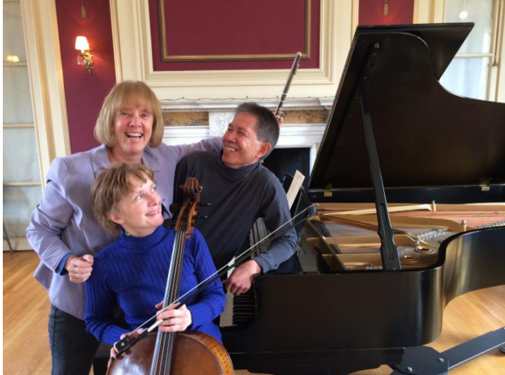
Trio Orione performs at Kent Recital Hall on Wednesday.

Through photography we can preserve the past but might we also imagine the future? Since its inception, photography has provided images of the frontier. NASA's missions explore our extraterrestrial frontier. The images of the moon, Mars, Jupiter and Saturn record a moment in proximate space and immediate time. The images of galaxies record light that has traveled for many millions of years to arrive at the camera's sensor.