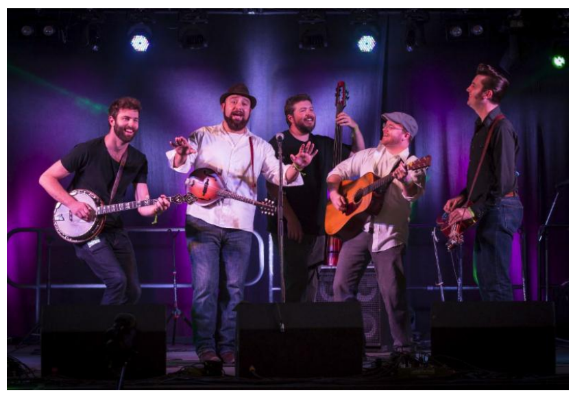
The HillBenders perform Saturday, Feb. 10.

Tickets are $28 for adults; $25 for senior citizens and Fitchburg State alumni and staff; and $5 for Fitchburg State students. Doors