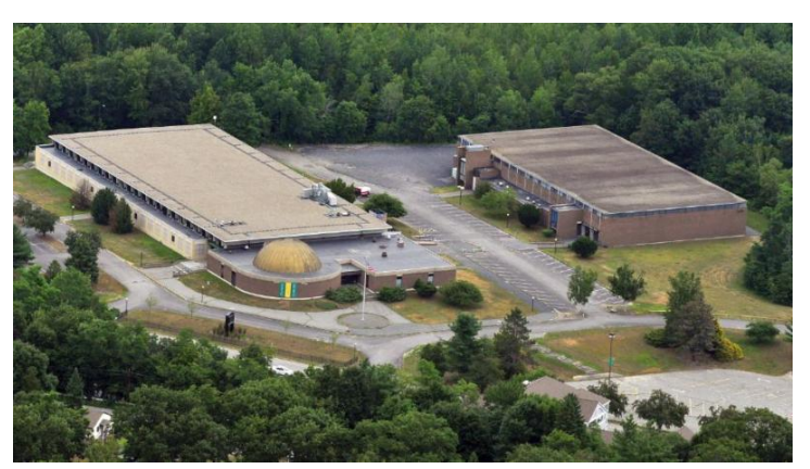
Landry Arena, at right, at the Civic Center complex

Landry Arena will house a new strength and conditioning center for university athletes, along with a practice field that will be open to the community during our athletic off-season. In addition to opening