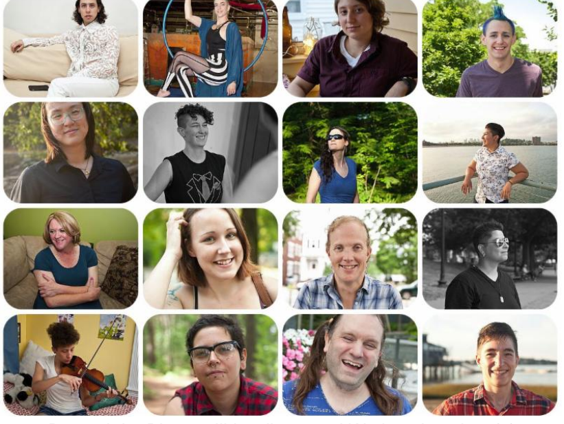
Beyond the Binary will be discussed Wednesday, Jan. 31

The spring series begins at 5:30 p.m. Wednesday, Jan. 31 with a talk by local artist