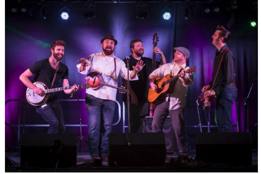
The HillBenders perform Saturday, Feb. 10.

Tickets are $28 for adults; $25 for senior citizens and Fitchburg State alumni and staff; and $5 for Fitchburg State students. Doors open at 7 p.m. for the 8 p.m. performance.