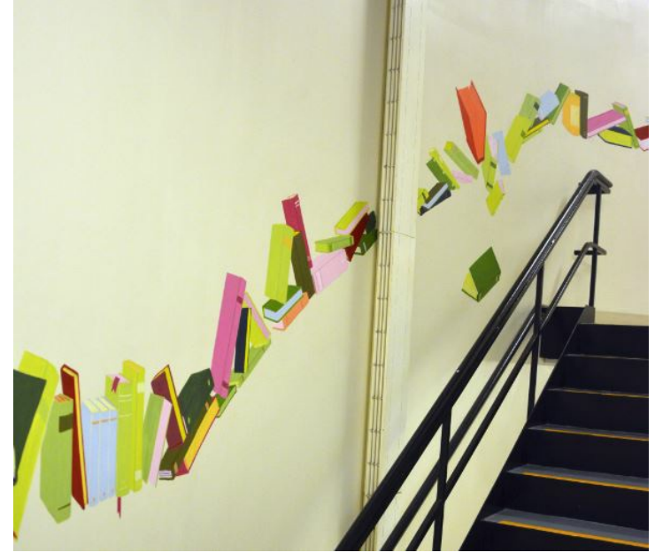
Artist KK Kozik painted a mural that spans several floors of the library stairwell.

will the discuss how the depiction of tumbling books relates to her use of the Four Humors to reflect the personalities of female Shakespeare characters.