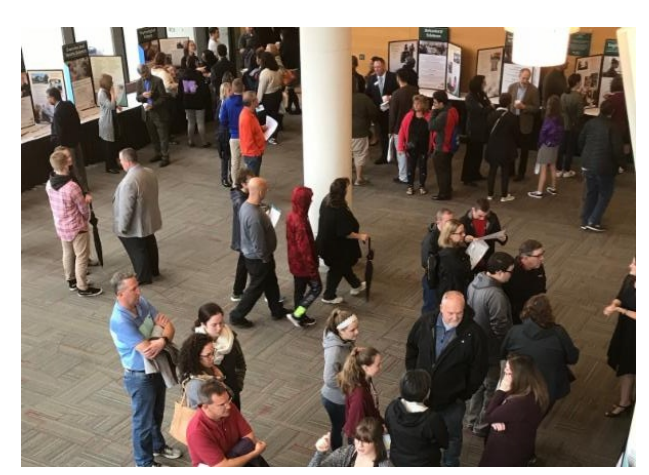
Visitors enjoyed our first open house of the season on Saturday.