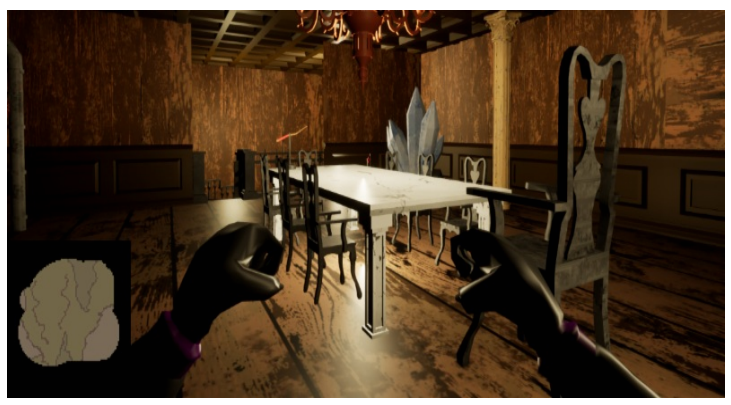
A screenshot of the early iteration of "Project Magus," now in development by game design students downtown.

These students are seniors, completing the capstone program in their game design majors. Fitchburg State hosts the only baccalaureate game design