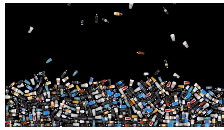
"Rain" by Lina Maria Giraldo

Giraldo creates screen-based computer-generated work using video, photography, physical computing, and data. It incorporates contemporary languages such as video games, advertising, repetition, and