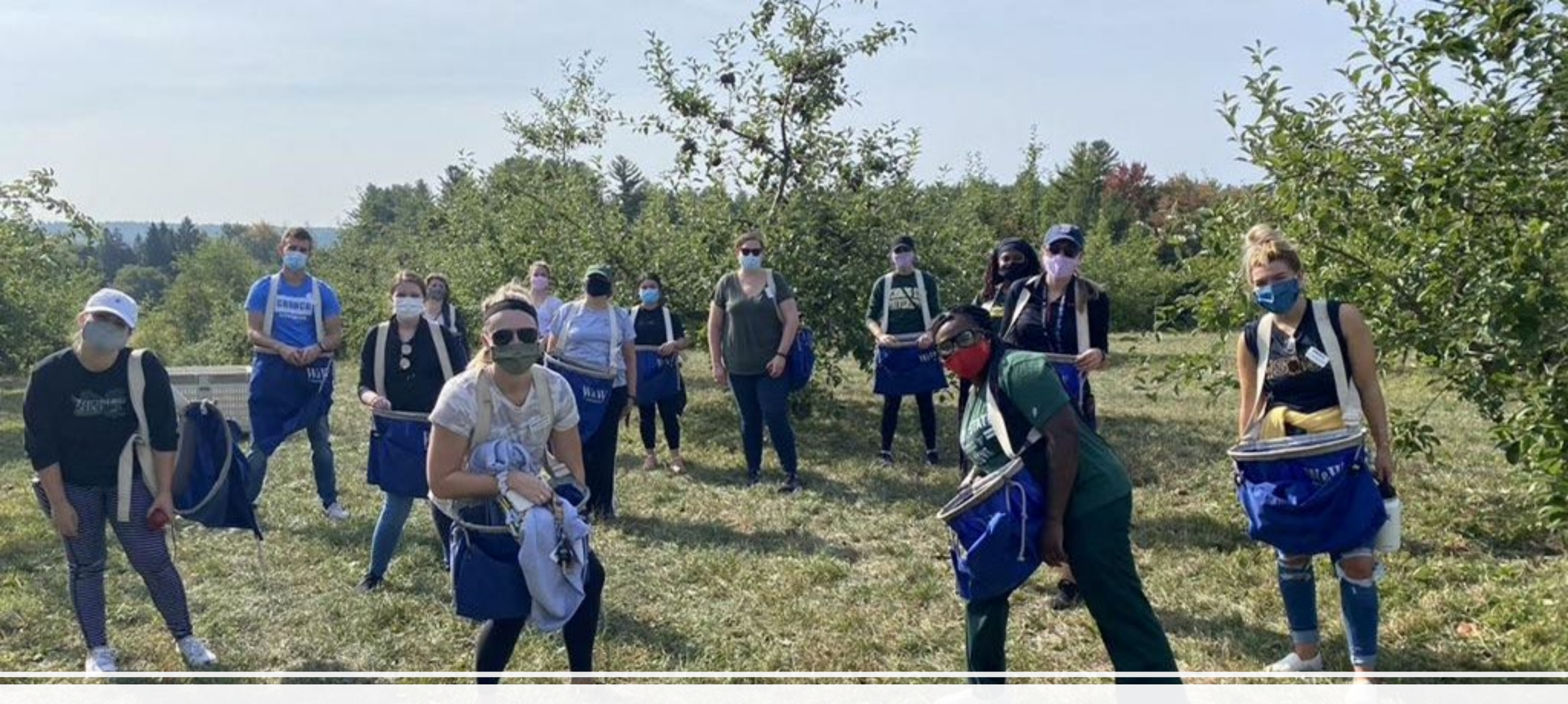
The Community Harvest Project