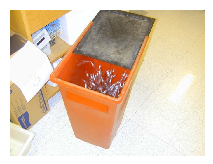
Figure 6.3 Sharps Container