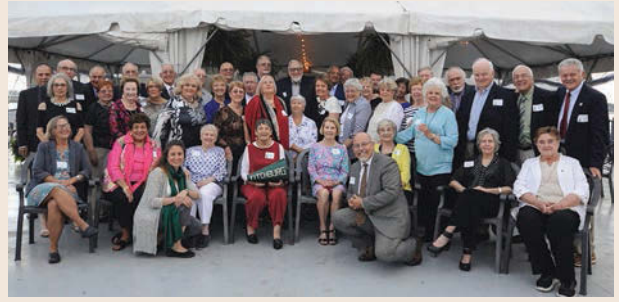
The Class of 1963 celebrated its 55th Reunion in September at DiMillo's On the Water Restaurant in Portland, Maine.