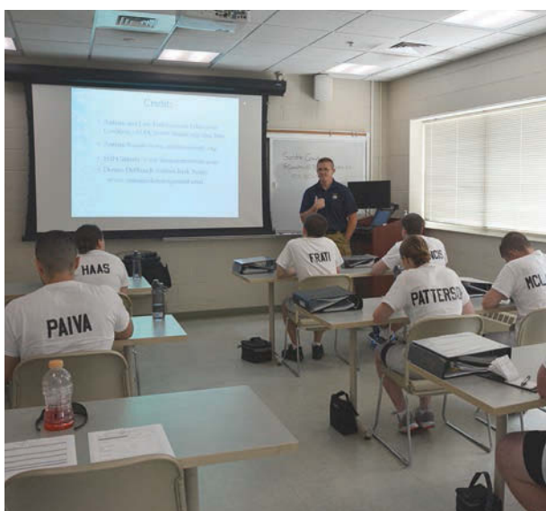
The police program students honed their tactical skills during an exhaustive 17-week academy this summer.